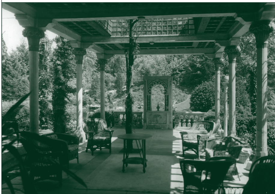
On front: Daffodil Terrace, Laurelton Hall south façade, c. 1925. Above: Daffodil Terrace, Laurelton Hall, c. 1925.

The design was quintessential Tiffany, embodying so many of his lifelong themes: the beauty of nature, his love of Eastern decorative ideas, his preference for humble materials, his taste for elegance, and above all, the combination of all this into a coherent whole of awesome aesthetic power.