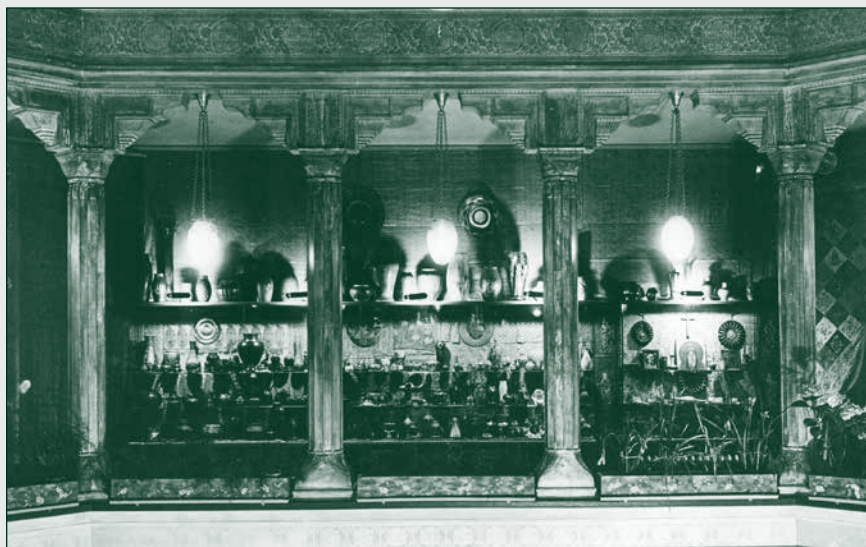
Above: Second-floor balcony, reception hall, Laurelton Hall, c. 1925.