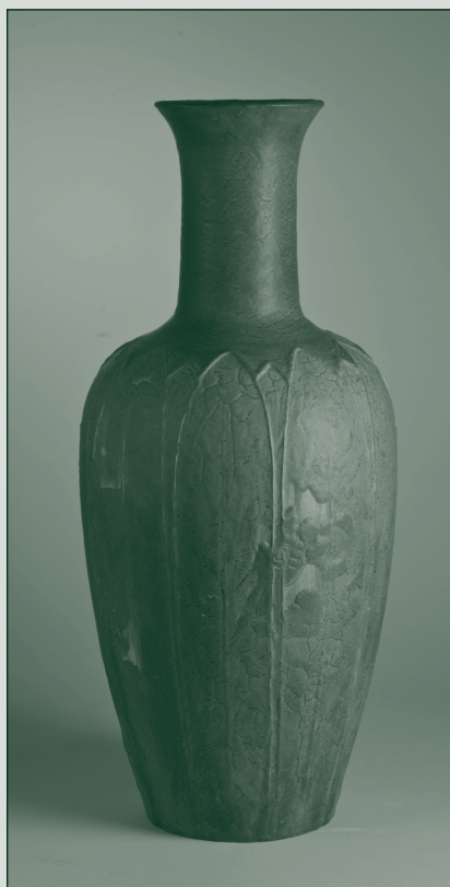
Above: Vase, c. 1905. Glazed earthenware; Grueby Faience Company, Boston, Massachusetts 1894–1909 (PO-078-68).

Corresponding to the Arts and Crafts tendency to promote local aesthetics, Grueby looked beyond Old-World taste in ceramic art and captured the bold simplicity of New England. Art connoisseurs of the period admired its design symmetry and pleasing textures. Colors ranged from deep green to saffron yellow to turquoise blue, with glazes that avoided luster in favor of capturing a surface of deeply saturated brilliance. Even the “peculiar effects produced by accidents of firing” were valued by collectors as evidence of the unique creation of each work.