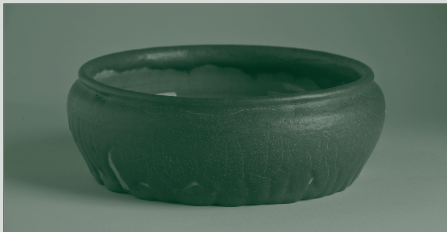
Above: Bowl, c. 1906. Glazed earthenware; Grueby Faience Company, Boston, Massachusetts 1894–1909 (PO-015-75).