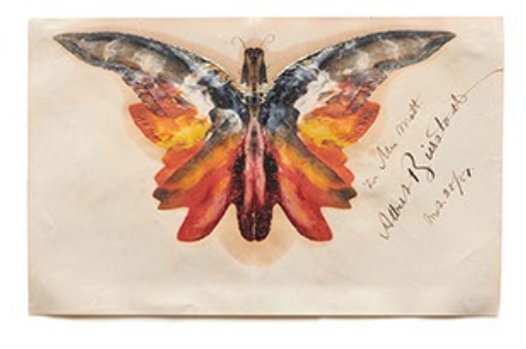
Butterfly , 1887. Oil on paper, Albert Bierstadt, American, 1830–1902; 4 7/8 x 7 3/4 in.; gift of Theodore E. and Susan Cragg Stebbins (2020-004:3).