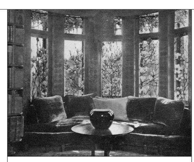
WISTERIA AND MAGNOLIA LEADED-GLASS BAY WINDOW FROM TIFFANY FAMILY RESIDENCE AT 27 EAST 72ND STREET, NEW YORK CITY.

Tiffany's home in the Bella Apartment House was an early showcase for his talent. and it suggested to him the market for a fresh type of interior design. Using family connections and financial backing and partnerships with established artists and designers, he was able to make a smooth transition from artist to interior designer. While many