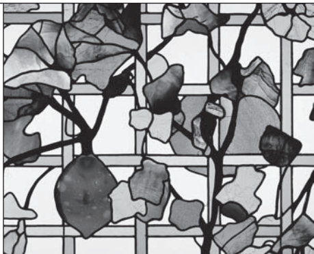
DETAIL, WINDOW FROM THE GEORGE KEMP HOUSE, NEW YORK, c. 1879. Squash, leaded glass, Louis Comfort Tiffany. (71-006).

Jeweled geometric design Leaded glass Tiffany Glass and Decorating Company (64-027)