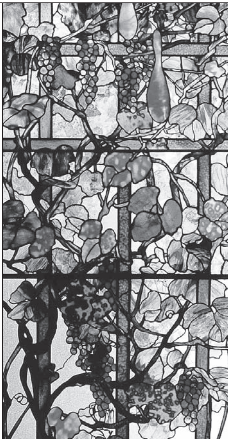
DETAIL, DOOR PANEL FROM THE AUGUST HECKSCHER HOUSE, NEW YORK, c. 1905. Autumn vines, leaded glass, Tiffany Studios. (58-011: A-D).

Inkstand, c. 1905-1930 No. 1094, Book Mark pattern, small Gilt bronze Tiffany Studios Stamped: TIFFANY STUDIOS / NEW YORK / 1094 (85-002: A)