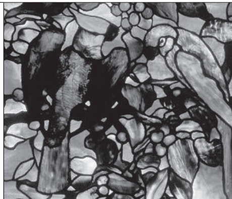
DETAIL, WINDOW FROM THE WILLIAM WATTS SHERMAN HOUSE, NEWPORT, RHODE ISLAND, c. 1880. Parrots, leaded glass, Louis Comfort Tiffany. (68-005).