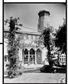
Loggia, or south garden entrance, Laurelton Hall,

Laurelton Hall was the country home and estate of Louis Comfort Tiffany (1848–1933). It was located on Long Island, thirty-five miles from New York City and overlooked Cold Spring Harbor, an inlet of Long Island Sound. The estate consisted of nearly six-hundred acres of rolling land and an eighty-four-room main house with its own bowling alley and an electrically lit, cork-lined tunnel providing access to the beach. It also included stables, conservatories (greenhouses), and a working farm.