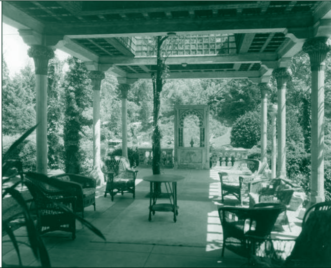
Daffodil Terrace, Laurelton Hall, c. 1925.

roof. The coffered ceiling in three bays around the skylight is composed of stenciled cedar, some of which Tiffany acquired in North Africa, and more than a hundred molded tiles in exotic geometric and floral motifs. These tiles, cast in a composite material of wood fibers and glue from Indian woodwork, are precise down to the wood-grain patterns of the originals.