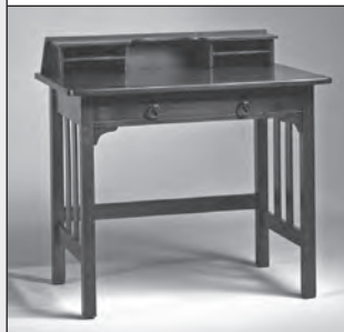
Writing desk, c. 1905. Oak, Stickley Brothers Company, 1891–1926, Grand Rapids, Michigan (FURN-038-88).

Arts and Crafts designers wanted interior rooms that were simple, attractive, healthy, coordinated, and calm. They focused on the “unity of design,” the harmonizing of color, pattern, building materials, and style.