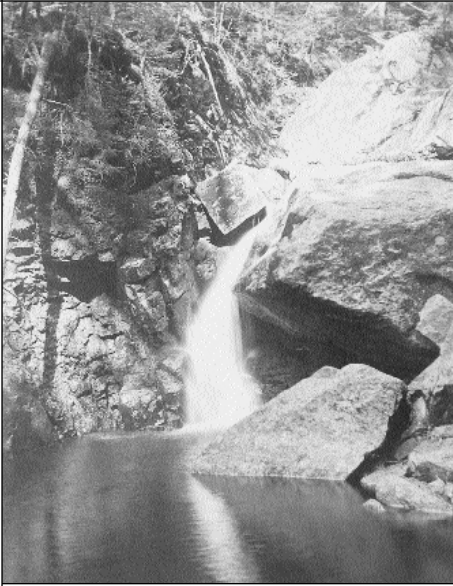
UNTITLED, CASCADE AND POOL, c. 1900, Louis Comfort Tiffany (28.200)

It is these photographs that make up this exhibition of almost 30 images from the Museum's collection. In them, we recognize Tiffany's discriminating eye and what certainly must have been the artist's joy in the camera's freeing ability to capture quickly what the eye beholds.