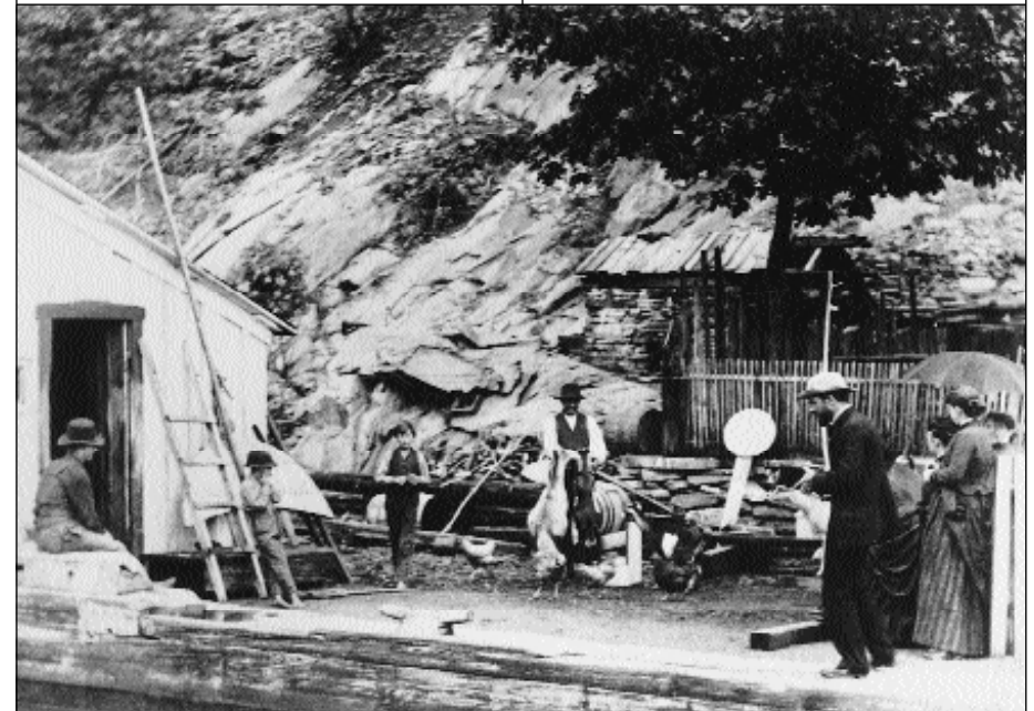
LOUIS COMFORT TIFFANY PHOTOGRAPHING CHILDREN NEAR LEHIGH CANAL, c. 1886.